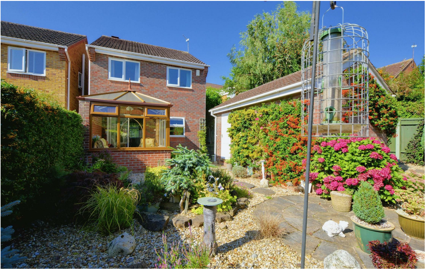
A spacious three bedroom detached house with a detached garage.

Situated in this sought-after and convenient residential location within easy reach of a variety of local shops and amenities including schools, transport links, nature reserves, Wollaton Park and the Queens Medical Centre this fantastic property is considered an ideal opportunity for a range of potential purchasers including; first time buyers, young professionals and families.